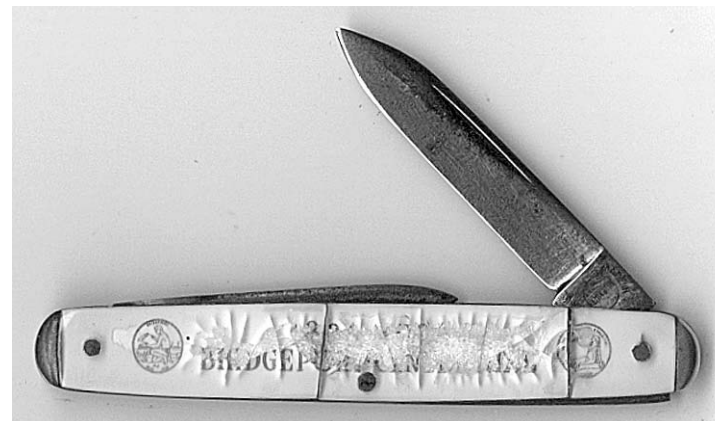
This rare Remington two blade knife has the date 1936 on it commemorating a Bridgeport celebration. The handles are so decomposed that the event is barely readable.

be premature decomposition. Likewise in the making of celluloid, there should have been a settling time in which the new product could shrink and settle in