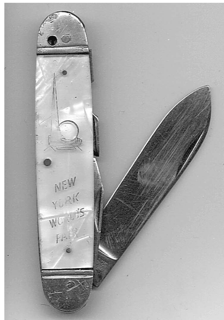
The front celluloid handle of the 1939 World's Fair knife shows no visible signs of decomposition, in contrast to the rear handle. This does not mean that it is not decomposing.