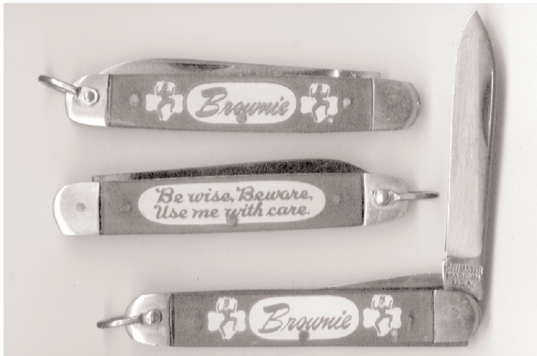
These 1950s vintage Brownie knives by Kutmaster have been my worst nightmare. It is possible they have been exposed to an environmental trigger that has prompted their decomposition. The open knife shows heavy staining on the exposed part of the blade when closed. The "Be Wise, Beware" has a double meaning here.