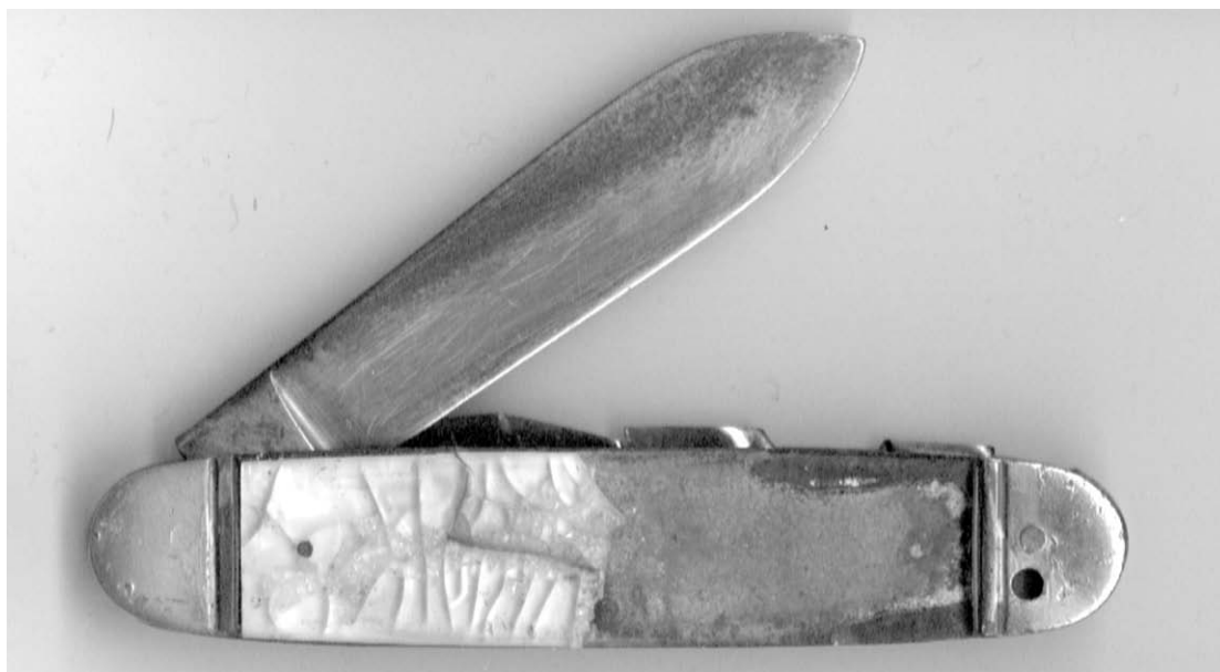
The rear celluloid handle of this Camillus 1939 World's Fair knife is decomposing to the point of cracking and breaking off. The blade shows rusting stains from the leeching effect of the celluloid.

the catalogs, the word "celluloid" is avoided as much as possible. The reason appears to be the flammability issue. If you dissect the pyremite & pyralin terms used by Remington, you will discover the word "pyro," which means fire. I suspect that the public was not aware of this in the purchase of a knife with this type handle material.