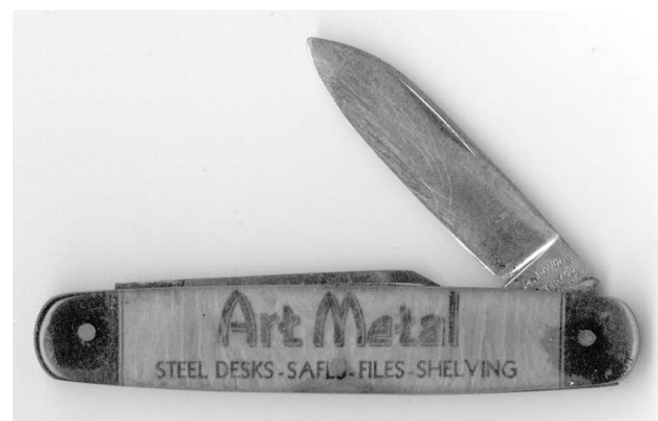
This Cattaraugus advertising knife is undergoing massive decomposition from the celluloid handles.

When celluloid was made there were several pretty nasty chemicals that went into the product. Sulfuric acid and nitric acid led the list of bad guys. If the resultant celluloid product was well washed and chemically manufactured, the chemicals were fairly inert. If the process was not strictly adhered to, then there could