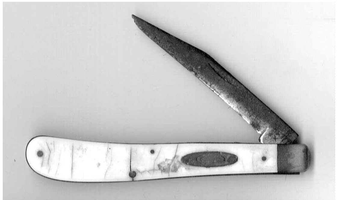
This Case single blade knife is celluloid at its worst.